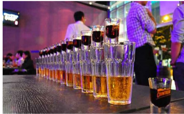
published on Jun 07 2010 - 16:43

They're too new to review, but that doesn't mean we don't recommend them